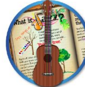
Instruments & Knowledge